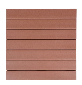
7 Slat Panel